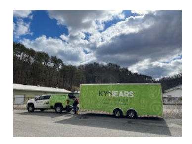
An amazing view in Inez, KY